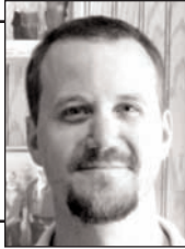
Grain Brad Stewart

Cash grain prices have rebounded nicely from their harvest lows. Cash corn is currently at or near $4.00 at all locations. Cash beans have reached $11.34 per bushel, and still seem to be strong.