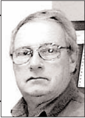
Waterloo Energy Center By Terry Grant

Spring 2009 has brought us several rainy days, but the crops are nearly planted.