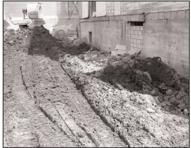
Beginnings of a new warehouse