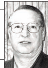
La Porte City

All that said, have a good growing season from everyone at the Ag Center, and Thanks !