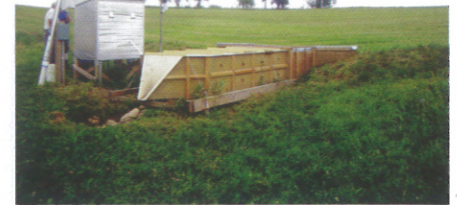
Discovery Farm site in Goodhue County

Discovery Farms Minnesota was launched in 2009 by farm organizations and commodity groups, specifically the Minnesota Agricultural Water Resources Coalition (MAWRC), with the support of the MDA and the University of Minnesota Extension.